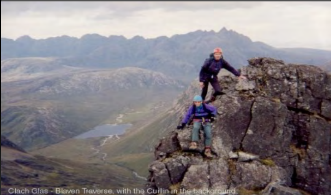
Clach Glas - Blaven Traverse, with the Cuillin in the background

SCRAMBLING & WALKING COURSES ON THE CUILLIN OF SKYE & KNOYDART