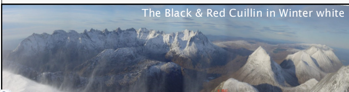
The Black & Red Cuillin in Winter white

▲ Recommendations can be made and accommodation arranged for you.