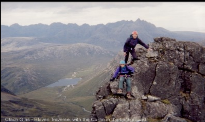
Clach Glas - Blaven Traverse, with the Cuillin in the background

SCRAMBLING & WALKING COURSES ON THE CUILLIN